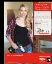
Handyman Magazine September 2010