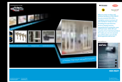
NZ Hardware Journal July 2010