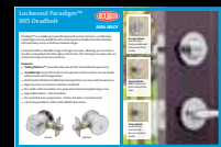
NZ Hardware Journal July 2010