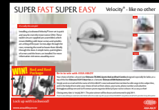
NZ Fishing Magazine May/June 2011