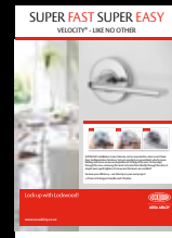
Certified Builders April/May 2011