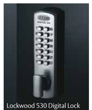
Lockwood 530 Digital Lock