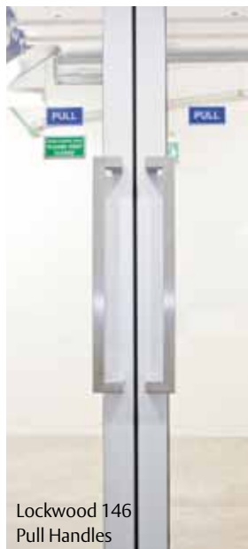
Lockwood 146 Pull Handles