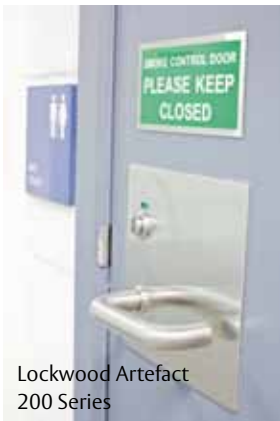
Lockwood Artefact 200 Series