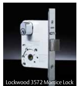
Lockwood 3572 Mortice Lock