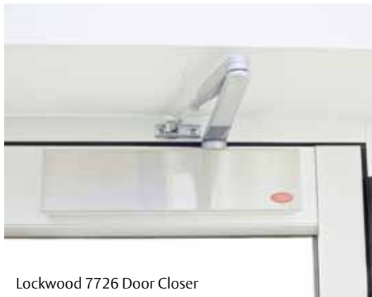
Lockwood 7726 Door Closer