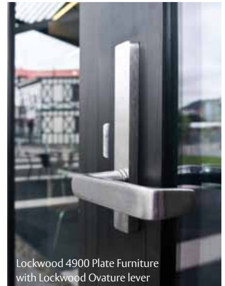
Lockwood 4900 Plate Furniture with Lockwood Ovature lever