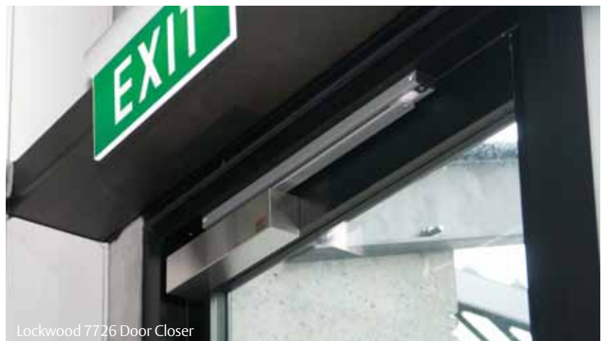
Lockwood 7726 Door Closer