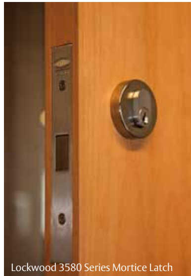
Lockwood 3580 Series Mortice Latch

The modern building appropriately expresses Maori history in its design and contributes a significant advancement to the cultural development of the Capital city. As Architectural Plus Ltd notes, the primary purpose of the Wharewaka is to showcase Te Raukura and other waka, but it is also, in its own right, an important building from a cultural, civic and architectural perspective.